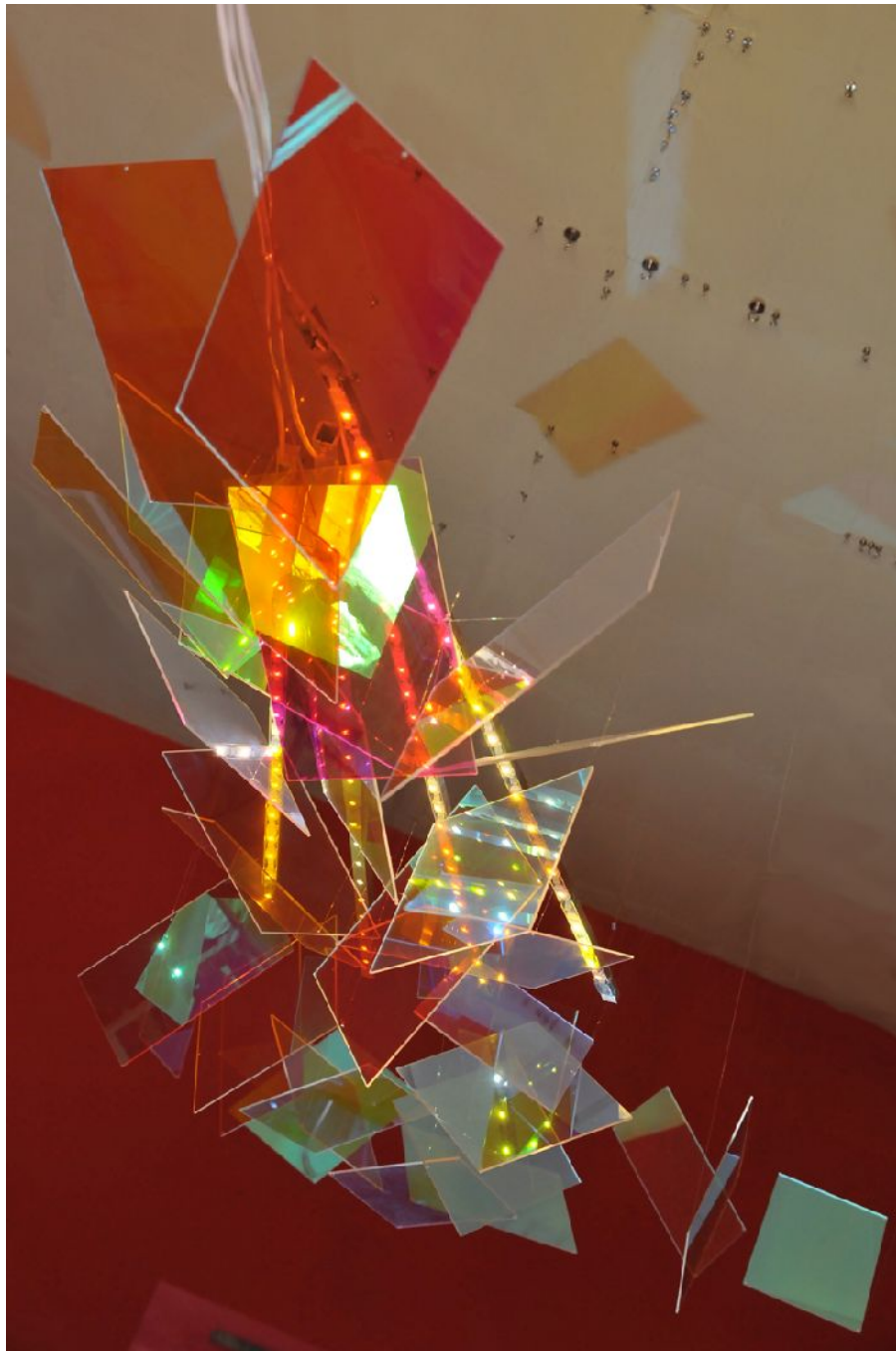
model diffraction / expérimentation volume 1, dimensions 6m/3m/2m.

diffraction, in a state of weightlessness, stopped clear in its progress, revealing each and every color of the chromatic circle. This plastic installation involves phenomena of resonance and light reflection.