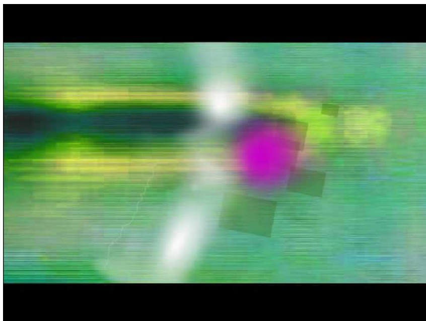
mille mondes with Lydwine van der Hulst

Production : ZINC, CECDC, 3bisF, CAC musique, CNC Dicréam