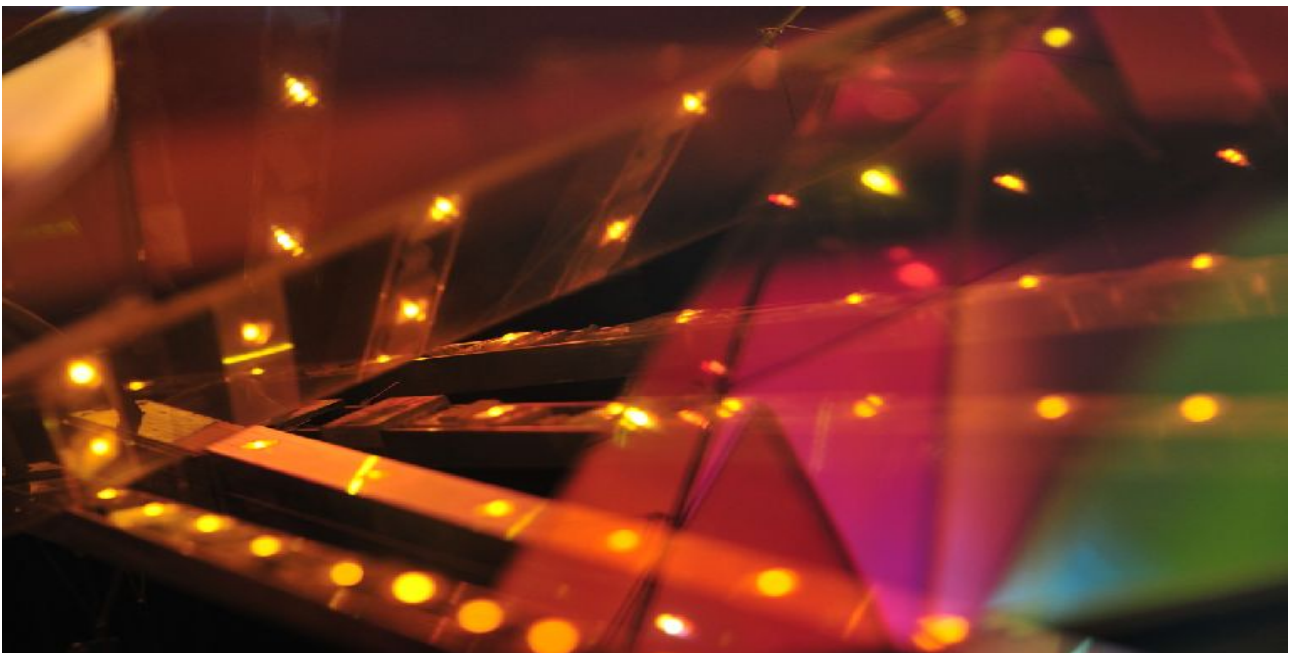
Diffraction (detail) 2009

The second stage, which started in 2007, brings together matter with a virtual dimension. It invites us into this system, to play out our perceptions in order to question the relationships we have with the world. These relationships are based on principles of coexistence founded on our presence as well as our actions.